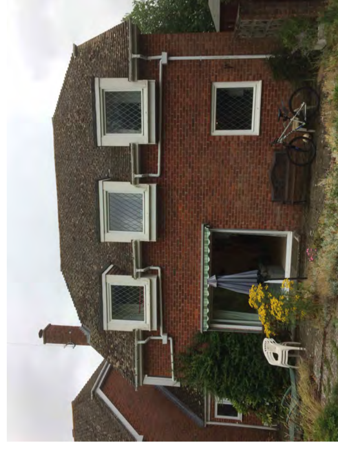
Rear of house from garden