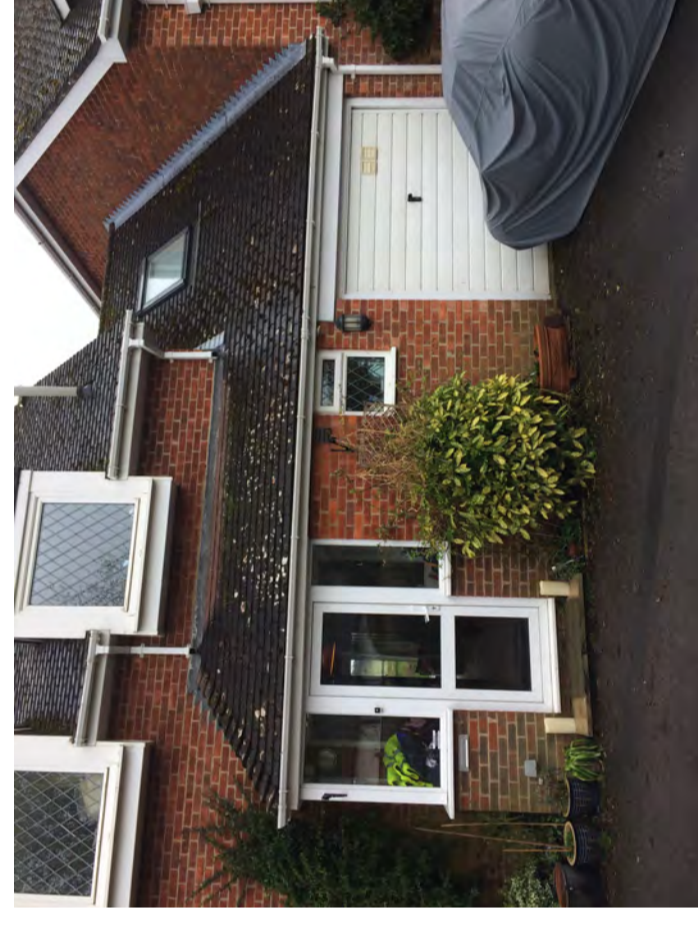
Front of house from drive