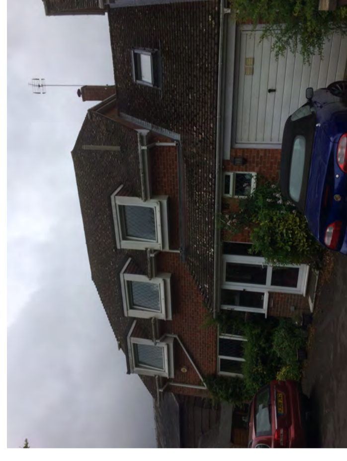
Front of house from drive