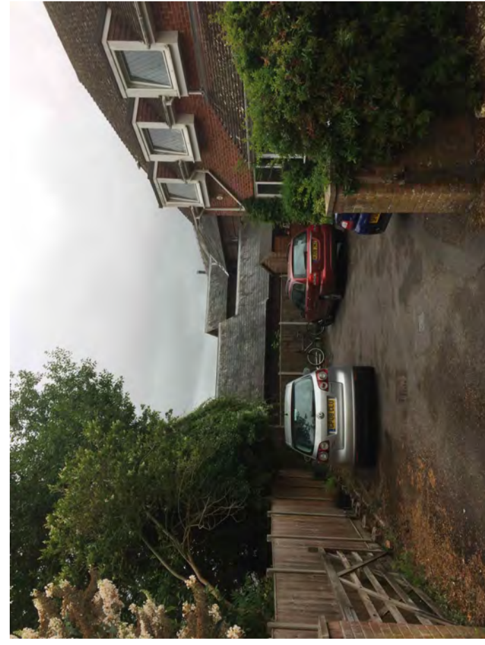
Front of house from drive