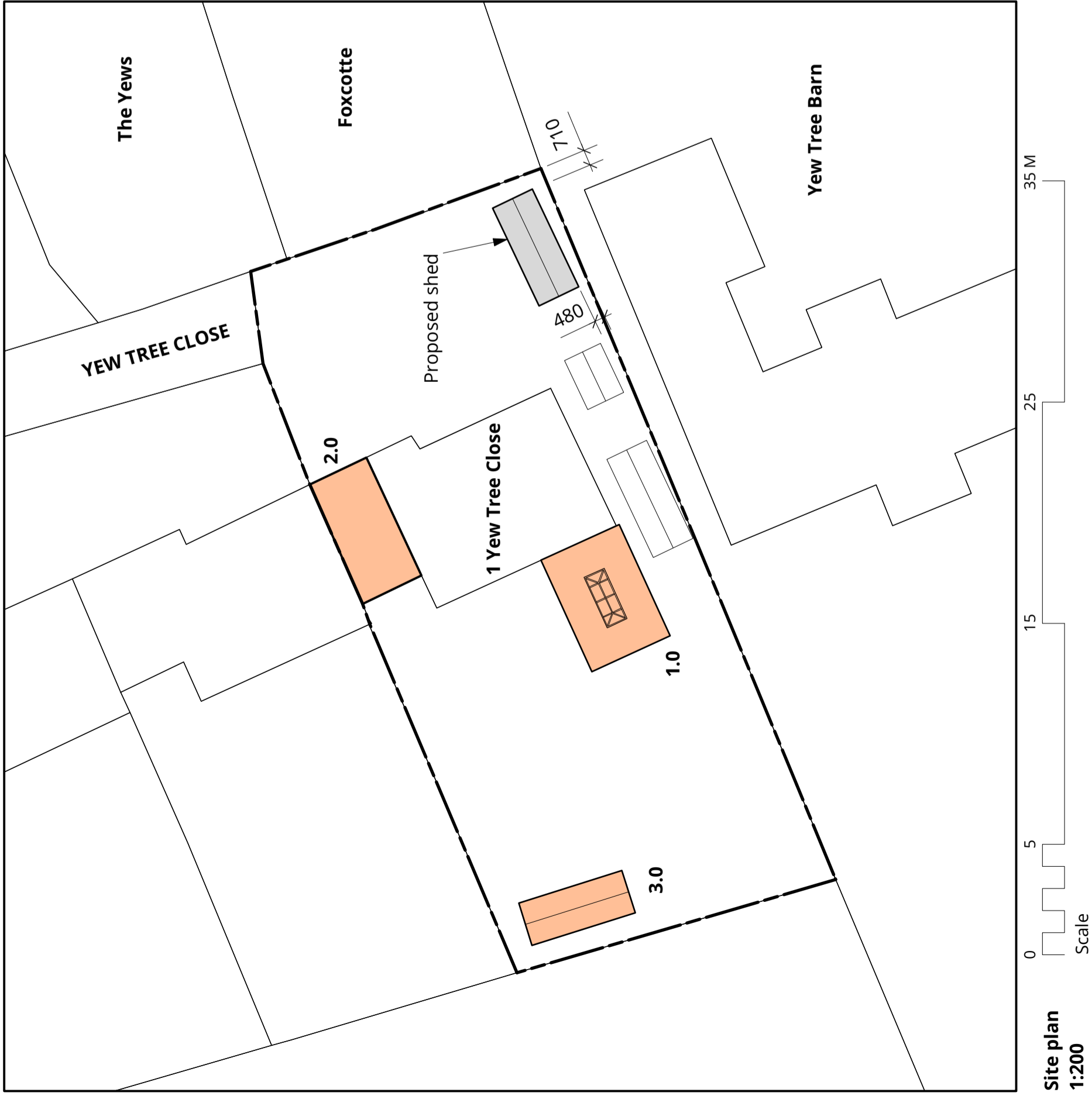
Site plan 1:200

Orange shaded areas indicates where permission has been granted for: 1.0 Garden room 2.0 Garage conversion 3.0 New shed Date granted 25/06/18. Ref: 18/01110/FULLN.